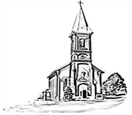
Faith - Tradition - Family