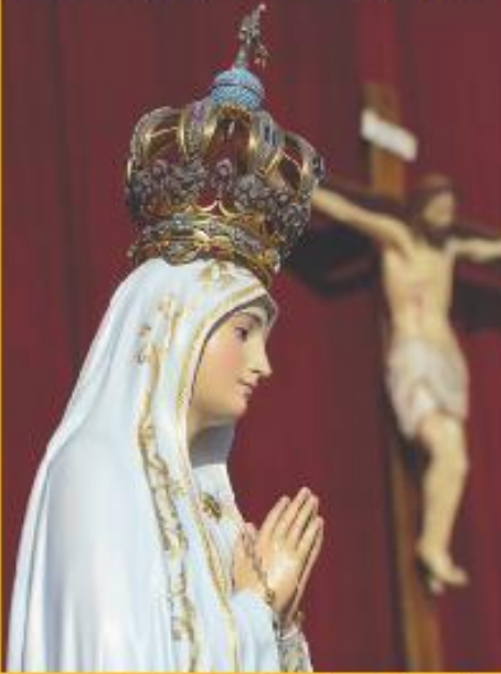
Prayer of St. John Paul II, Evangelium Vitae

For each day, begin with the daily intention, Our Father, 3 Hail Marys, Glory Be, and conclude with the Prayer of St. John Paul II.